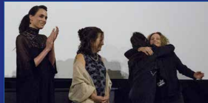
"A.K.A. NADIA" - TALINN BLACK NIGHTS FILM FESTIVAL