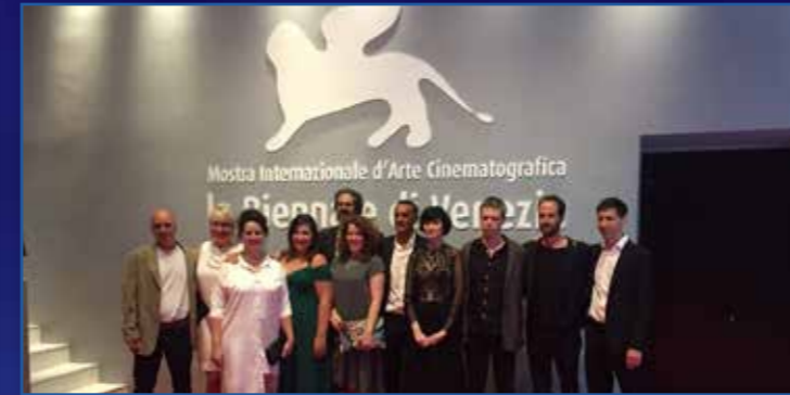
"MOUNTAIN" - VENICE FILM FESTIVAL