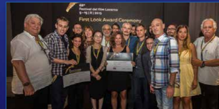
LOCARNO FILM FESTIVAL / "FIRST LOOK" ON ISRAELI CINEMA