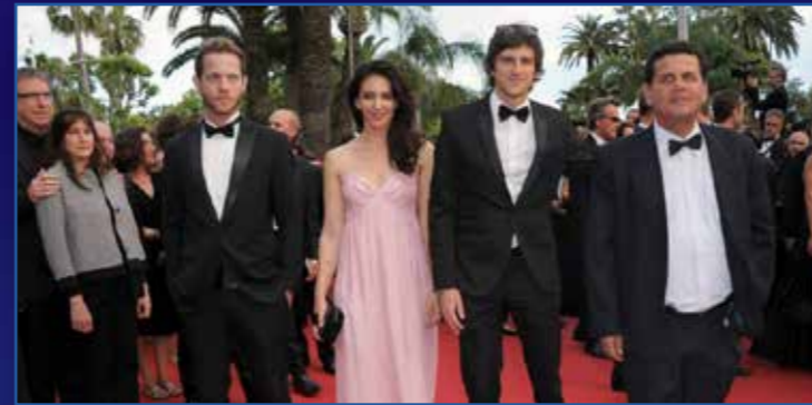
"AFTERTHOUGHT" - CANNES FILM FESTIVAL

The Israel Film Fund is committed to keep on supporting and encourage Israeli filmmakers to be truthful to themselves and to tell the story of Israel's reality with professional integrity and with total freedom.